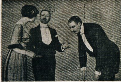
شكل ۱۵ - سوزاناسیوره [نقب مجم] - يك آيبرماما به دقت ايده و كرم تكاوانه ويچ بلك كوستر مكنزين اكييله لي . نكسي يك تاشوش اولور . برخاته اوكنده؛ قولري وجوددن